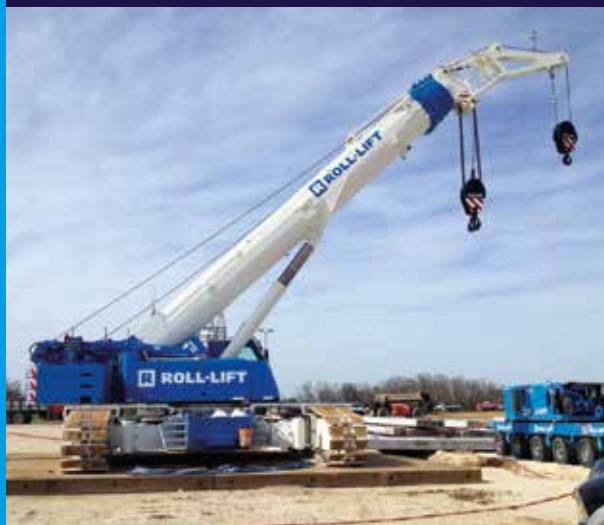
Telescopic Crawler Cranes